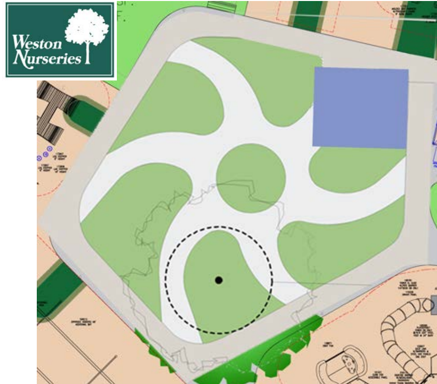
“Five Senses Garden & Labyrinth”